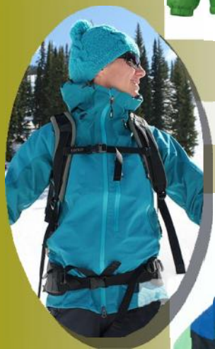
Hard shell jacket