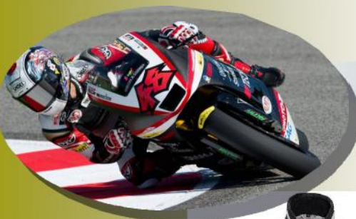
Motor bike wear