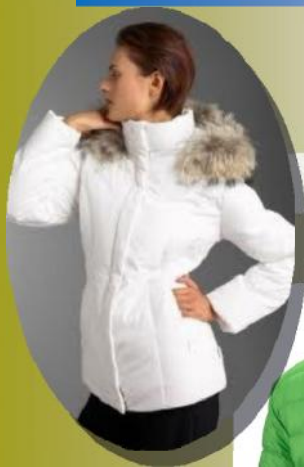
Down Jacket & vest