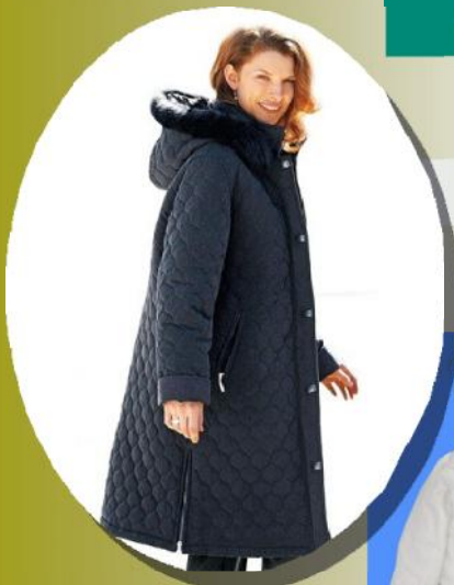
Padding Jacket & Parka