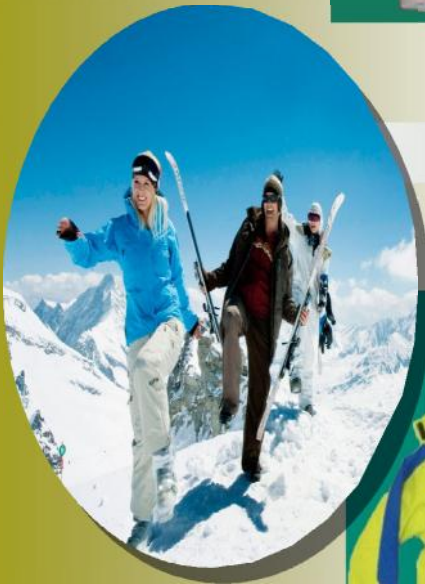
Snow & ski wear