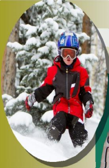
Out door wear